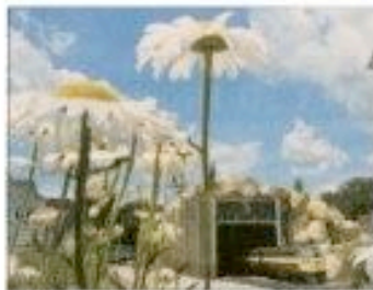
Devises appear to dwarf a house as the model team makes the rounds of a garden setting.