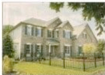
The Columbia model at Lake Sun Estates in North Azusa has a big surprise in the backyards.