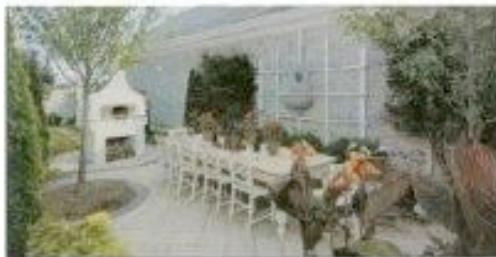
The "Luscious" garden was inspired by Italy and centers on a pizza oven and large table.