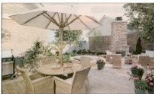
This package at West Point Gardens features a fireplace, hot tub and dining area on a deck.