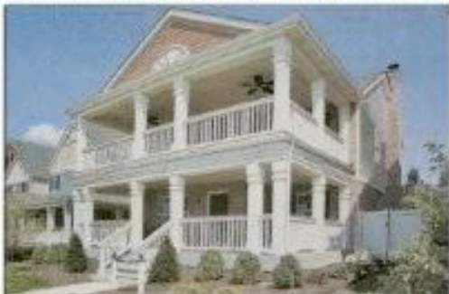
Packages have been returned to a place of prominence at West Point Gardens in Elgin.

landscaped, and tiled, more common, even one used as that a person can picture how their house would look a few years from now, he said. Also, this shows the home and the view from the second floor of the houses. All of the gardens have 2-hour private tours and scheduled 45 to 60-minute tours that can be upgraded.