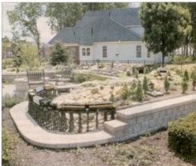
This big "garden" from display took a month to get up in the large yard of a Tall Brothers home.