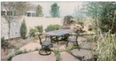
This "Daisy" setting features a material and larger than usual trees and other plants.